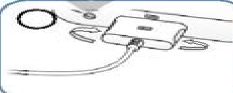
Use iPod Connector to FireWire Cable