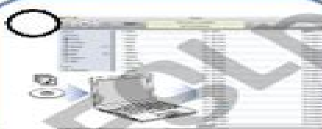
Connect iPod and Music