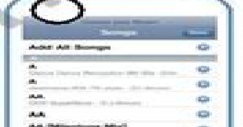
Connect iPod and Music