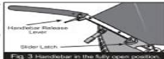
Fig. 3 Handlebar in the fully open position.

Swingarm in unfolded position with shock in position 1.