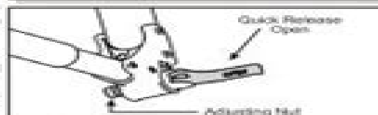
Fig. 4 Rear wheel Quick Release with lever in open position.