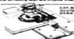
CAT. NO. 79-001 ROUTER & GRASP GRIP

Professional Router cuts made easy. Holds Black & Decker and other popular routers securely on workpiece base top. Over a solid frame off support for all types router cuts.