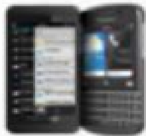
BlackBerry® 10 Smartphones