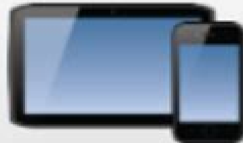
iOS® & Android™ Devices

Personal Owned/BYOD and Corporate Deployed