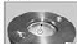
Remove the top cover of the hydraulic pump. Page 20-20-1