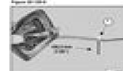
Remove the top cover of the hydraulic pump. Page 20-20-1