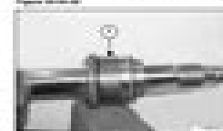
Remove the top cover of the hydraulic pump. Page 20-20-1