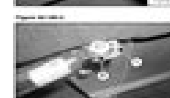
Remove the top cover of the hydraulic pump. Page 20-20-1