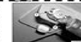
Remove the top cover of the hydraulic pump (Figure 30-10-12)