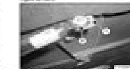
Remove the top cover of the hydraulic pump (Figure 30-10-14)