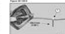
Remove the top cover of the hydraulic pump (Figure 30-10-6)