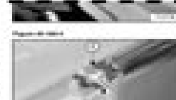
Remove the top cover of the hydraulic pump (Figure 30-10-13)