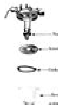
FIG. 11a Fuel system showing the place fuel should be cleaned.

Clean the fuel strainer and sediment bowl about every 100 hours of operation. See FIG. 11a. To do this, proceed as follows: