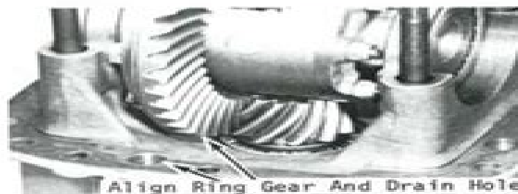
Align Ring Gear And Drain Hole