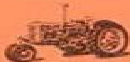
Model 1937 Standard Power

"DC-3" - "DC-4" - "DC5" "D" - "DO" - "DE"