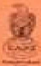
Model 1937 Standard Power