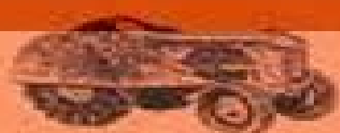
Model 1937 Standard Power