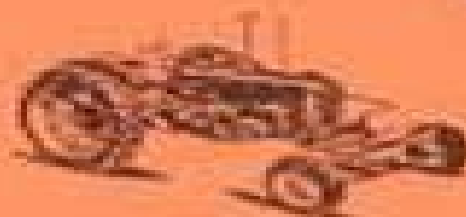
Model 1937 Standard Power