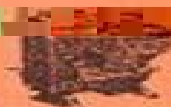
Model 1937 Standard Power