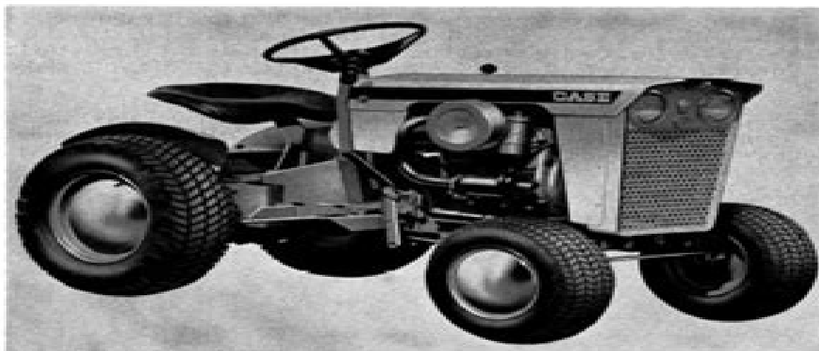
Figure 1. Right Hand View of Case 130 Tractor