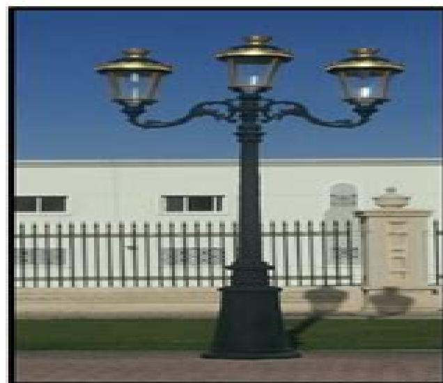
Figure 1: conventional Street Lamps in AUS

pressure sodium lamps for the street lighting purpose. The HPS lamps have several defects. It radiates a large amount of heat and requires 250W for each lamp, thereby increasing the cost of the energy. The AUS campus has a total of 705 posts and every post has 3 or 4 lamps. The power required by a post is 750 to 1000 watts continuously working for 12 hours a day. This would consume a lot of energy at high prices.