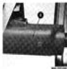
Left front side of the front axle.