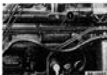
Left side of engine crankcase.