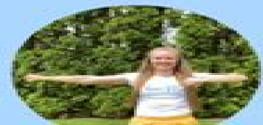
BOW & ARROW