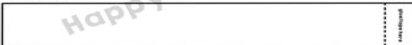
left side piece