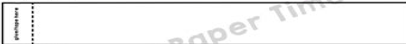
right side piece