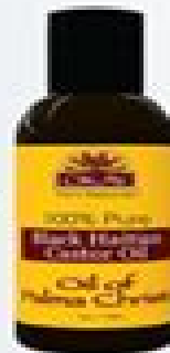
Jamaican black castor oil