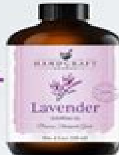
Lavender essential oil