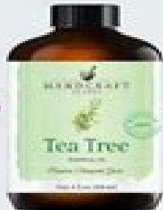
Tea tree essential oil