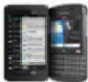
BlackBerry® 10 Smartphones