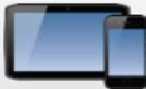
iOS® & Android™ Devices

Personal Owned/BYOD and Corporate Deployed