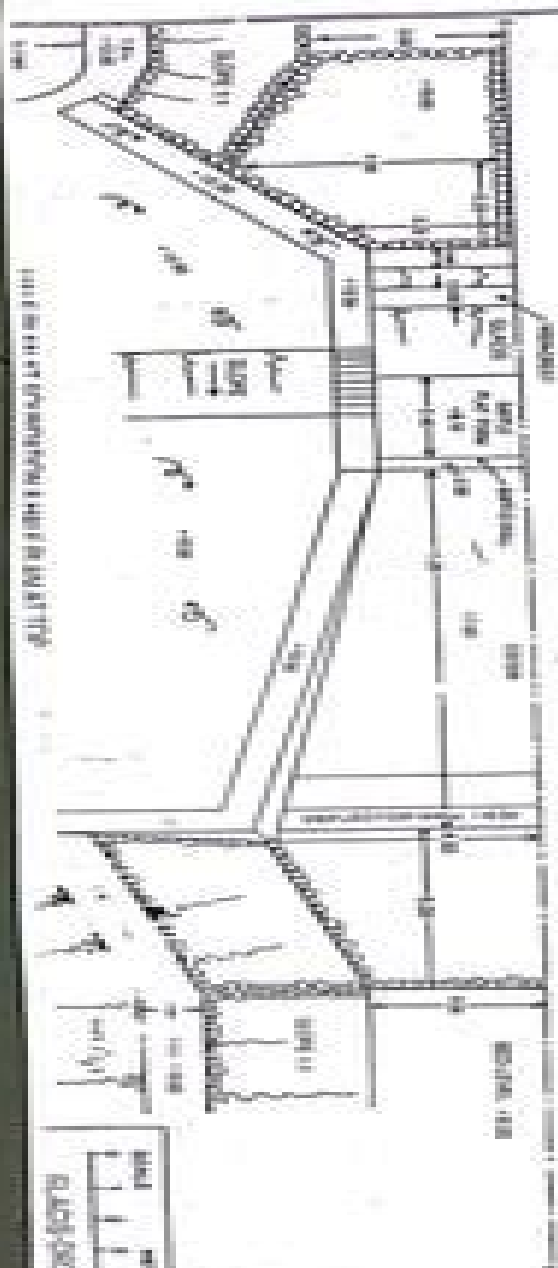
FIG. 1. PLAN OF CONCRETE HOUSE, 10' BY 12' 6"