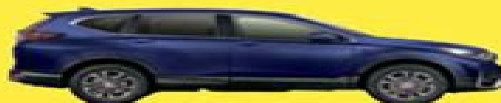
HONDA CR-V HYBRID