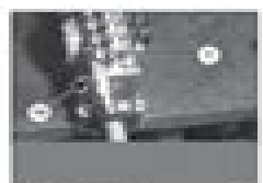
Fig. 5: Disassembly of the governor assembly