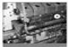
Fig. 2: Disassembly of the fuel pump assembly