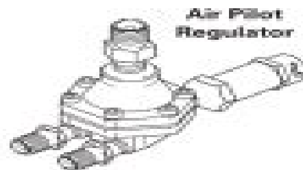
Air Pilot Regulator

IMPORTANT: Read and follow all instructions and safety precautions before using this equipment. Retain for future reference.