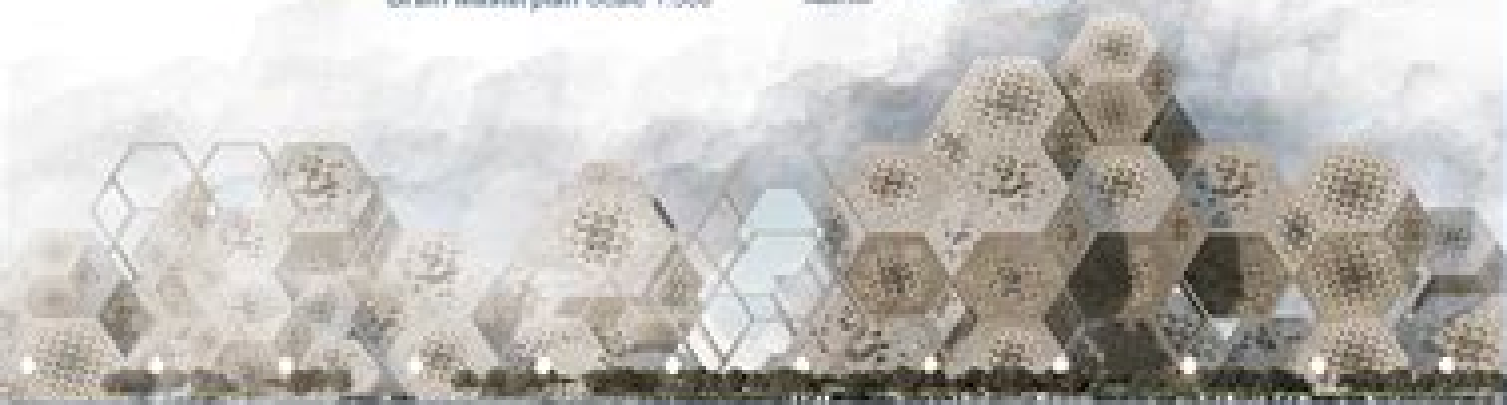
Western Elevation Scale 1:500