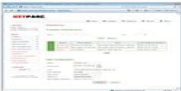
Keyperarc Business Enterprise Server web-based management console