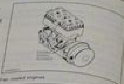
Engine serial number