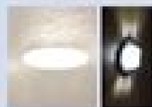
Energy Efficient LED Lighting Including Exterior Security Lights, LED Floor Lights on Cadet 26C8H and Clipper