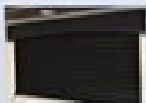
Upgraded Plated Night Shades with Valance