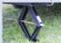
Heavy-duty Stabilizing Jacks Add Comfort