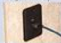
USB Ports Throughout