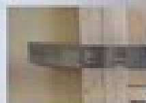
Hurricane Straps Add Strength and Safety