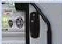
Upgraded Friction Hinge Door with EuroLatch Entrance Handle