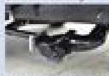
Floating Sewer Hook for Easy Positioning and Better Ground Clearance