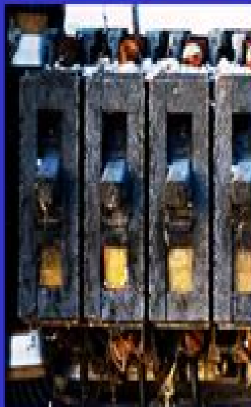
Corrosion or Rust