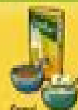
Cereal Cooked: 30 g Raw: 125 ml (1/2 cup)