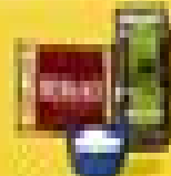
Cooked rice, lentils or quinoa 125 ml (1/2 cup)