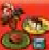
Cooked fish, shellfish, poultry, lean meat 75 g (1/2 cup) 125 ml (1/2 cup)