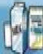
Milk or powdered milk (reconstituted) 250 ml (1 cup)