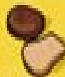
Bread 1 slice (30 g)