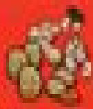
Shelled nuts and seeds 30 ml (2 tbsp)