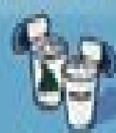
Yogurt 175 g (3/4 cup)