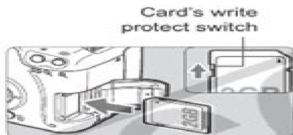
Card's write protect switch