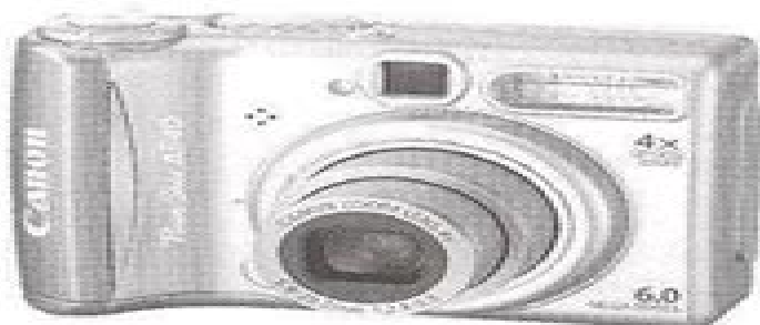
Photo of PowerShot A540