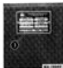
Right side of cab.