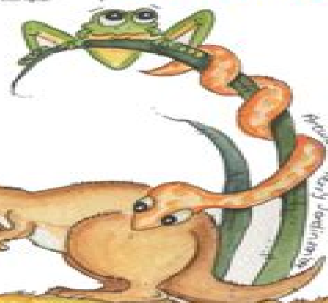
Illustration by Kerry Tomlinson