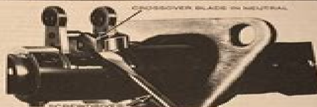
Holding cross-over blades in neutral