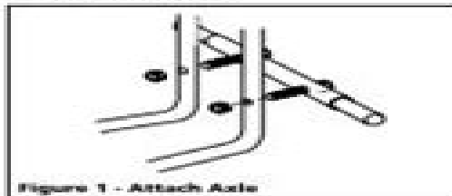
Figure 1 - Attach Axle