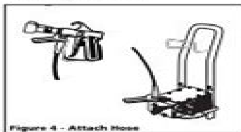
Figure 4 - Attach Hose