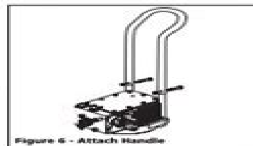
Figure 6 - Attach Handle