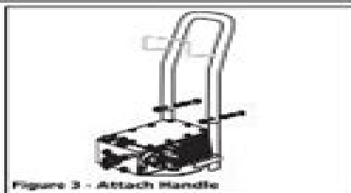
Figure 3 - Attach Handle