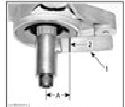
1. Tip of backlash measurement tool 2. Mark on tab 3. Dial indicator

From center of bolt, measure 20 mm (8 in) and scribe a mark on the tab.