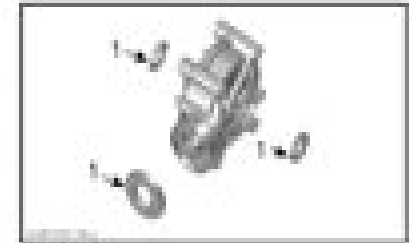
1. Check oil seals

Check if oil seals are brittle, hard or damaged. Replace if necessary.