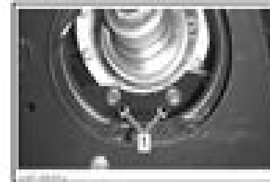
1. Loosen final drive screw

Remove final drive upper bolts and the front bolts of the final drive support.