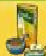
Cereal Cooked: 30 g Raw: 125 ml (1/2 cup)