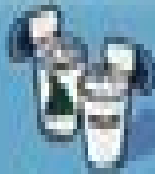
Yogurt 175 g (3/4 cup)