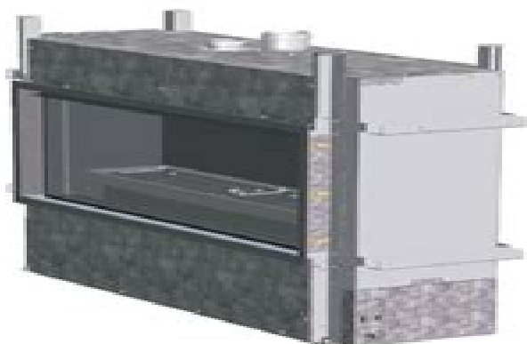
Model Latitude 1000

Please read this manual before installing and using this heater