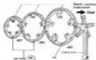
Illustration 8 is between the MPV marks on end of the mark 135.

Insert radiator cap to allow pressure to build in the system.