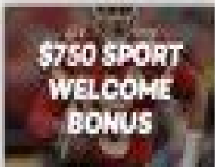
Sports Welcome Bonus