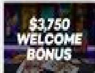
Casino Welcome Bonus