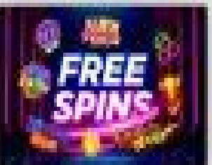
Free Spins Bonus