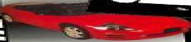
The 2004 Step 10. 2004