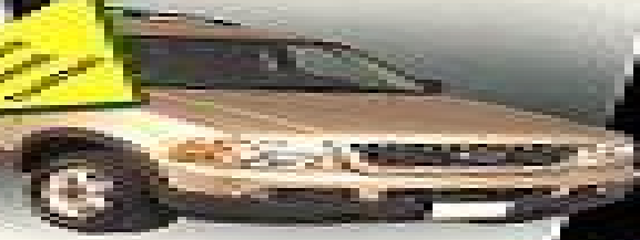
The 2004 Step 10. 2004

2004 FORD FOCUS/FOCUS 2004 CC REPAIR MANUAL