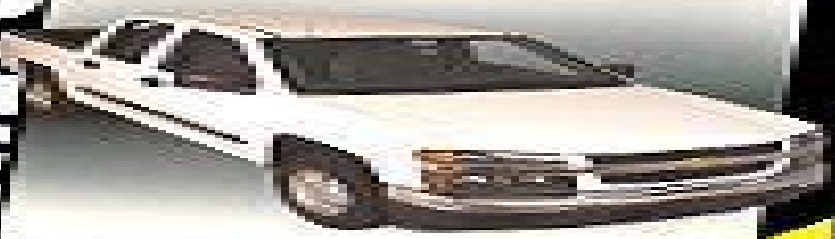
The 2004 Step 10. 2004