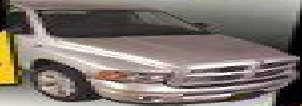
The 2004 Step 10. 2004