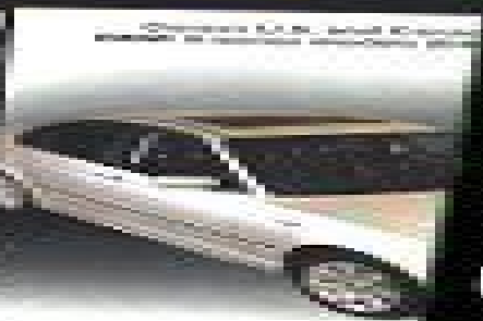
The 2004 Step 10. 2004