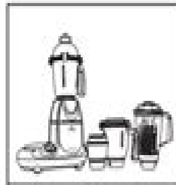
TWISTER (4 Jar)