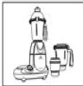
TWISTER (3 Jar)