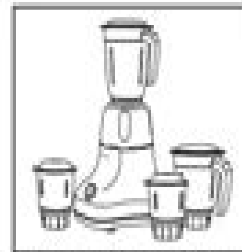
GX 400 DUO CHUTNEY JAR