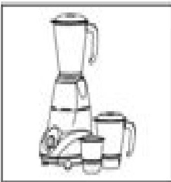
REX (2 Jar) REX (3 Jar)