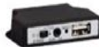
The connector port

The Connector port allows easier access to the USB and Aux connections of the gateway, and provides a bypass switch and an easy reset option. The iPod connection and charging is possible directly through the iPod Dock Cable or an iPod Cradle (not included).