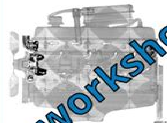
FIG. 8—Engine Components