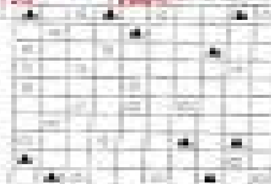
Figure 4. Ecology 100 Years