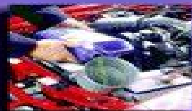
Heating and Air Conditioning Systems