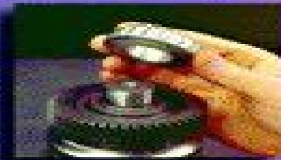
Automatic Transmissions and Transaxles