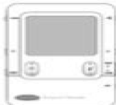
Fig. 1 – Infinity™ Control

NOTE: Read the entire instruction manual before starting the installation.