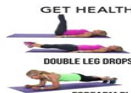
DOUBLE LEG DROPS