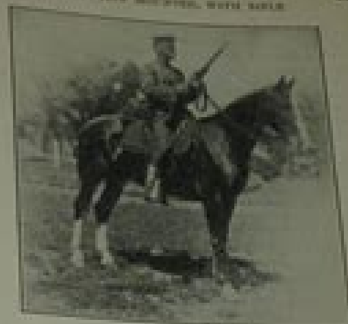
FIG. 2.—In load

12. To fire —The only classes of fire practicable to employ mounted with the rifle are fire at will and fire en masse , and these are infinitely applicable only to small groups of companies, platoons, or individual men.