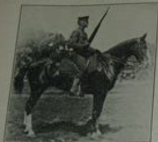
FIG. 1.—In advance rifle

9. To load —While at the advance rifle, the soldier keeps the rifle to the left and places it on the right thigh and catches the butt in the left and places it on the right of about 45 degrees. Support the rifle to the left by the thumb and forefinger of the left hand, the other hand closed on the trigger and, taking care not to change the holding of the rifle, load the piece and assume the position of advance rifle.