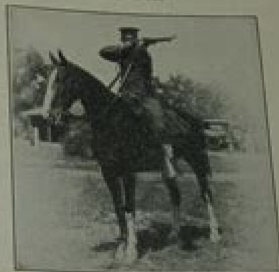
FIG. 3.—In aim