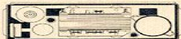
Fig. 3: 6 V arrangement