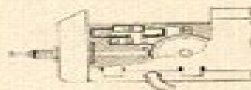
Fig. 1 Heater circuit changed for 6 V