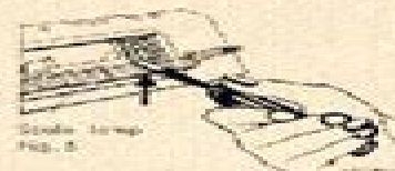
Scale lamp Fig. 5

Shift the pointer fully to the left. At the right-hand end of the scale frame is a slot containing a spring clip which holds the scale in place. Press this inwards with a screwdriver until the scale springs out. Press the scale lamp holder gently upwards with a screwdriver (see Fig. 5). The holder will then spring out and the lamp can be changed. Replace the holder at an angle in the recess with its flattened side downwards (Fig. 6) and press home lightly with the finger until a click is heard. Replace the scale.