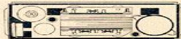
Fig. 4: 12 V arrangement