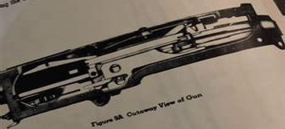
Figure 5A. Outwash View of Crin.

As the gun is cocked, and the rear portion of the gun barrel is locked, the burning powder violently generates gas which, under pressure, pushes against the back of the cartridge case and which has a thrusting force of five tons pushes the bullet out of the barrel. This action locks the bolt positively against the rear of the cartridge of the next round.