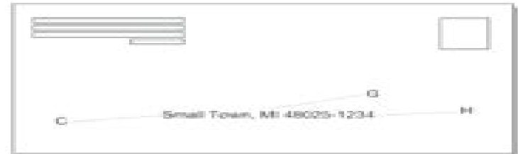
Addressed Envelope 2