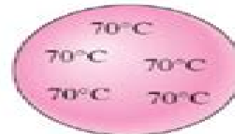
(a) Copper ball

Heat transfer analysis that utilizes this idealization is known as lumped system analysis .